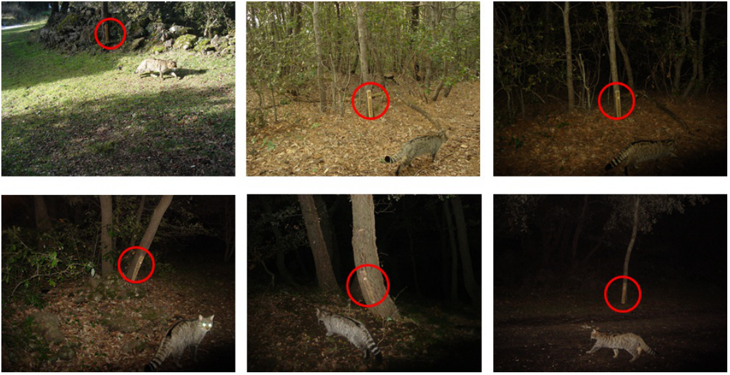
Figure 3 – Six passages of wildcat detected by camera trapping during the day and the night. Red circles highlight the wooden stick.

to be interested in valerian tincture scent. In their study Kery et al. 2011 assessed that valerian tincture is most efficient from November to April with maximum success in March, so our monitoring period (November-December), being out of wildcat mating period (from December to March), might have negatively influenced the likelihood to collect hair samples. Furthermore, hair trapping failure was not probably due to the use of the camera flash during the night: in the cited Swiss study some of the sticks were monitored by camera-trapping equipped with a flash and several “flashed” pictures of wildcat rubbing against sticks were gained (Raydelet, 2009). Moreover, two events were obtained in the morning and wildcats didn’t seem to be interested in the lure as well. Additionally, one wildcat passed (again showing no interest for the scent) in front of an hair trap just one hour after the cork replacement (Fig. 3). Finally, the long term camera-trapping project conducted in the same study area did not highlight the occurrence of trap-avoidance behavior (Anile et al., 2009, 2010, 2012a,b) because several recaptures were obtained during each monitoring.