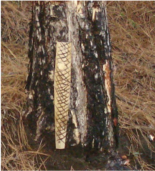
Figure 2 – A wooden stick used in this study.

The overall photo-capture success rate, excluding the domestic cat, was 1 capture/24.5